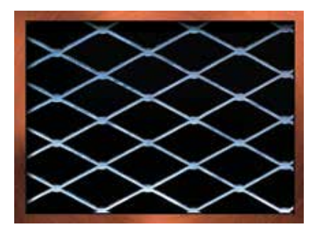
3/4" 18 Flattened