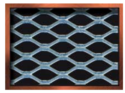
1/2" 20 Flattened