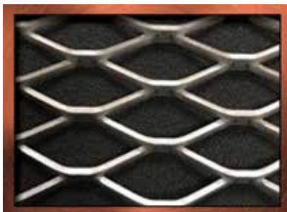
1 1/2" 16 Unflattened