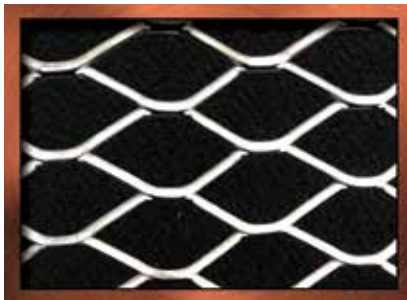
1/2" 20 Unflattened