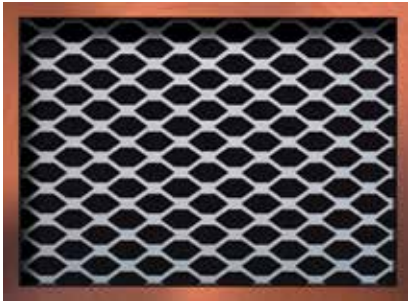
SH 3/16" Flattened

Coils or Sheets of Spantek high speed mesh are available for a wide variety of FILTER applications. Patterns can be engineered to your exacting specifications using our state of the art CAD capabilities. Widths range from 2" - 48".