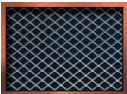
5/16" HEX Flattened